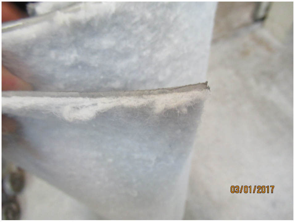
Figure 2 – Detail of the test specimen.