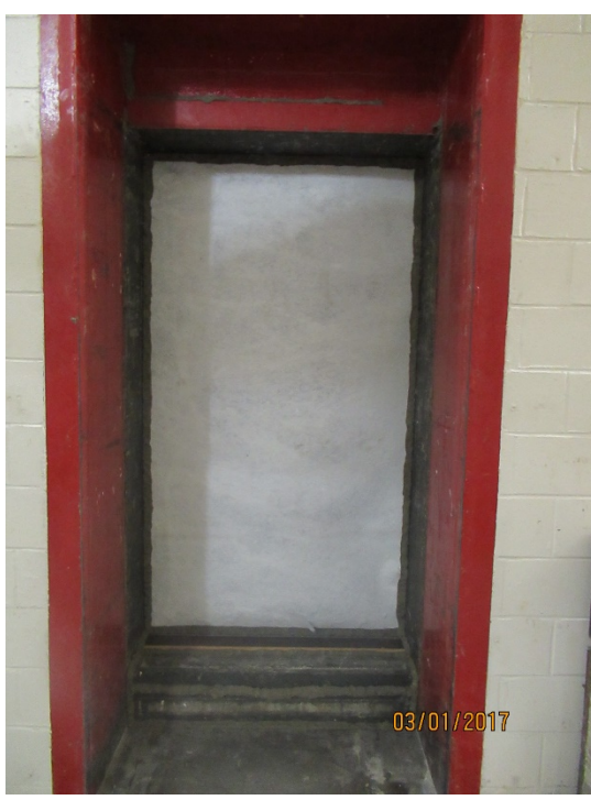
Figure 1 – Specimen mounted in the test opening.