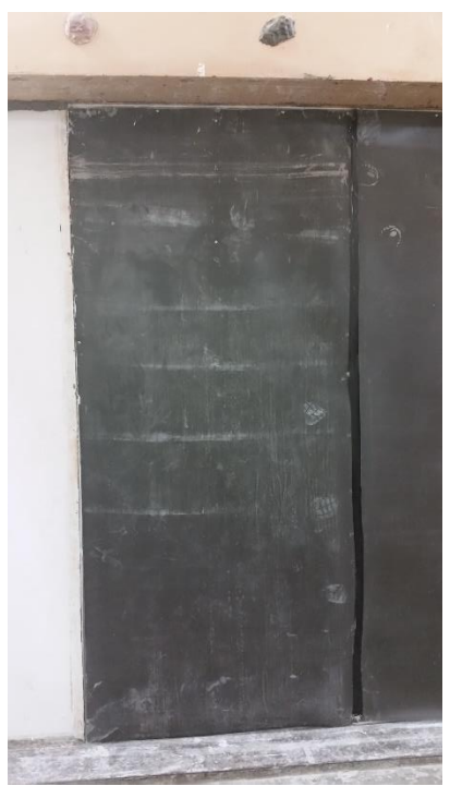
Figure 4 – Mass loaded vinyl layer installed