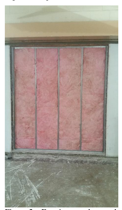
Figure 2 – Framing members and cavity insulation installed