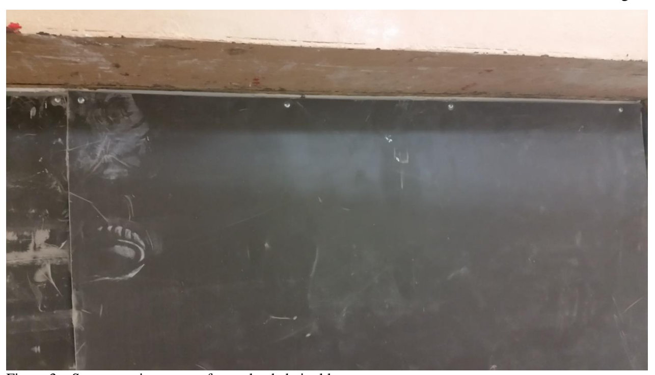
Figure 3 – Screw spacing at top of mass loaded vinyl layer