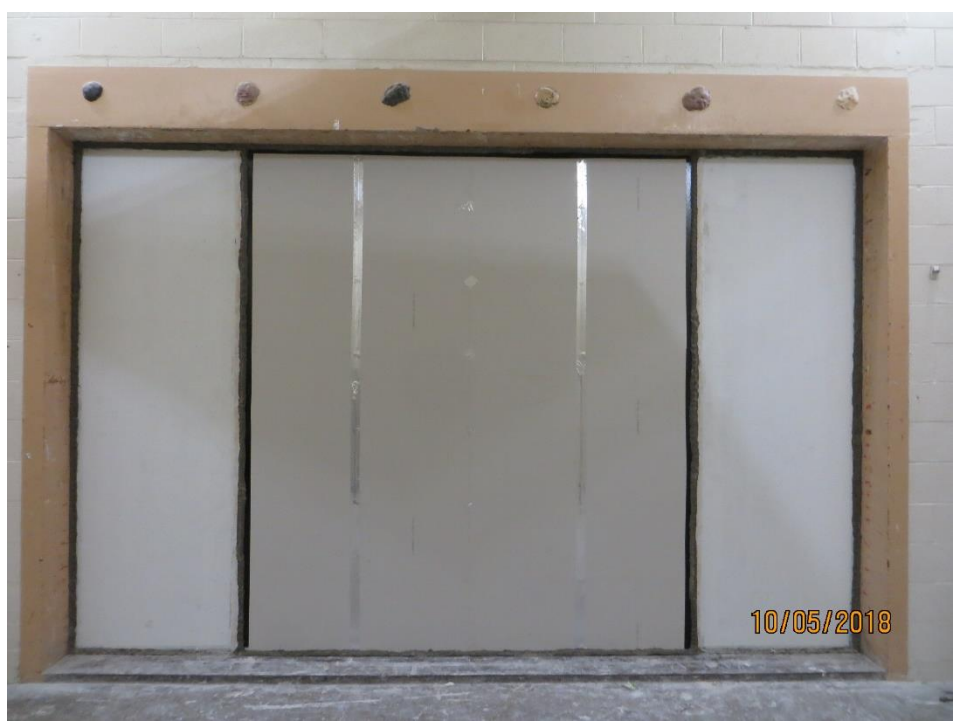
Figure 1 – Specimen mounted in test opening, as viewed from source room